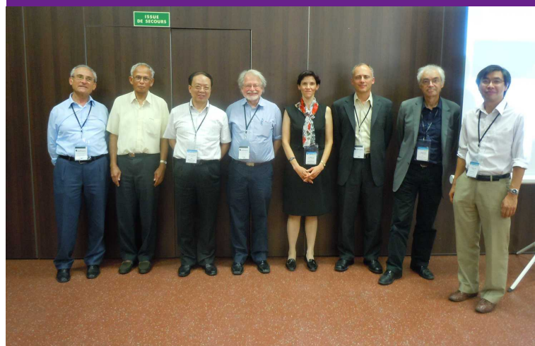
IWRA Executive Board Meeting

Next Board Meeting will be held in Porto de Galinhas, Brazil during the 14 th World Water Congress.