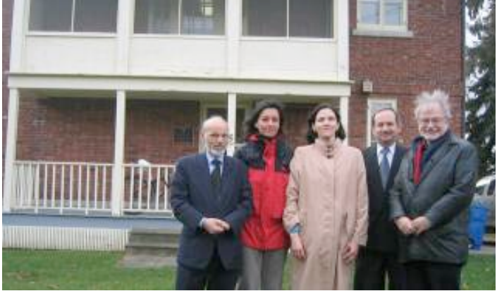
Brace Centre for Water Resources Management, Macdonald Campus, on a windy November day.