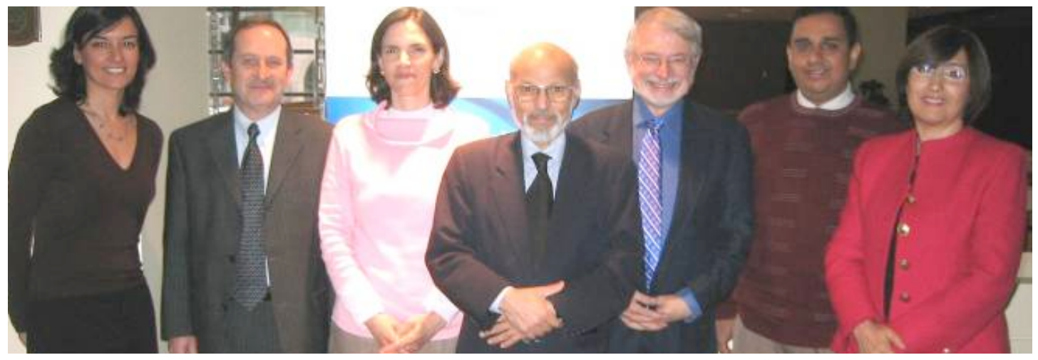
Executive Board annual meeting— Montreal 2006

During the Board Meeting held on November 19-20, 2006, in Montreal, the following decisions were made: