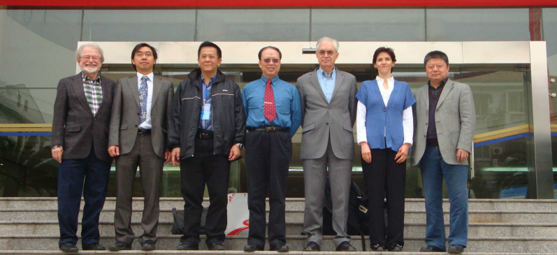
International Workshops on IWRM and Methodologies on Hydrology

to 5 th Int'l Symposium on IWRM and 3 rd Int'l Symposium on Methodology in Hydrology