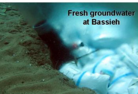
Capture and monitoring system