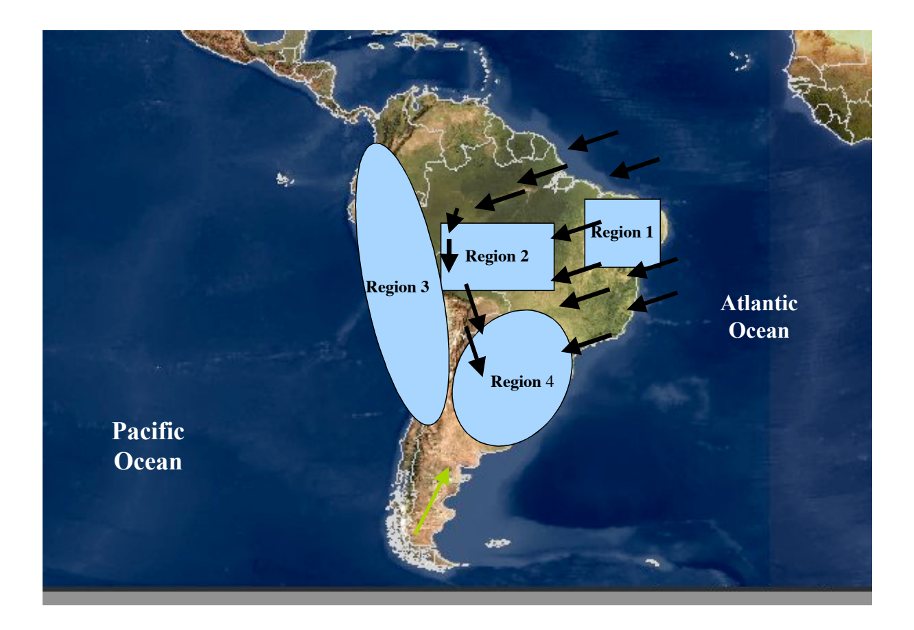
Figure 1: Synoptic situation during the 1970's. The blue color indicates an increase of precipitation in all regions. The black arrows show how the water vapor flux can penetrate inland with a southward shift of the Hadley circulation. The green arrow shows the potential southern water vapor transport.