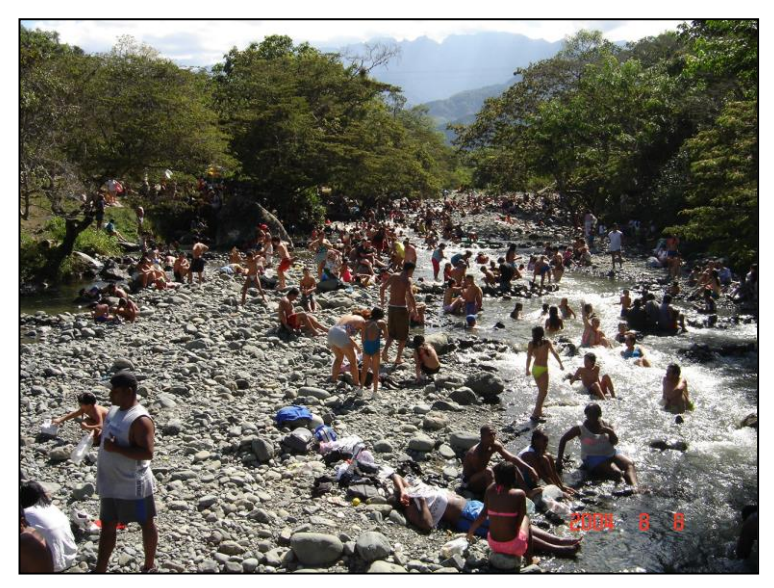
Pance River in a weekend of summer

This situation of calm in the area, "it is not believed" by environmental authorities, or municipal, who avoided the maximum transit through it to carry out its duty, here finding the best excuse to leave out of state planning, this territory, and therefore the official version is that of terrorism, that makes invisible to the population or is believing that "vacate" territory.