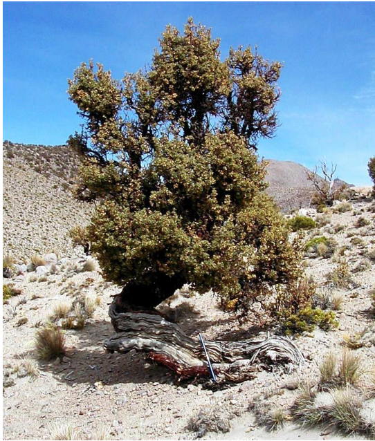
Figure 1 Polylepis tarapacana growing on the slope of Tata Sabaya volcano, Bolivia, at 4600 m.

Polylepis tarapacana is a small tree growing at elevations of 4500-5000m on volcanoes of the high Altiplano of Bolivia, Chile and Argentina (Fig. 1). Previous studies have shown the radial growth of this tree is highly sensitive to climate variations in the Bolivian Altiplano and demonstrated the significant skill of this species as a proxy for precipitation variation (Morales et al 2004, Soliz et al 2009). Ongoing sampling of Polylepis tarapacana has led to the development of a 700-year long regional chronology for the southern Bolivian Altiplano. This significant contribution to tropical dendrochronology (sites are between 17-23°S) has allowed estimation of rainfall variability in the high Andes and the identification of severe droughts during past centuries (Fig. 2). This tree-ring reconstruction captures 54% of the instrumental precipitation variance. Spectral analysis of the tree-ring reconstruction reveals significant peaks at interannual, decadal and interdecadal periods which are in agreement with the main oscillatory modes of the instrumental records and the Niño3.4 and PDO indices.