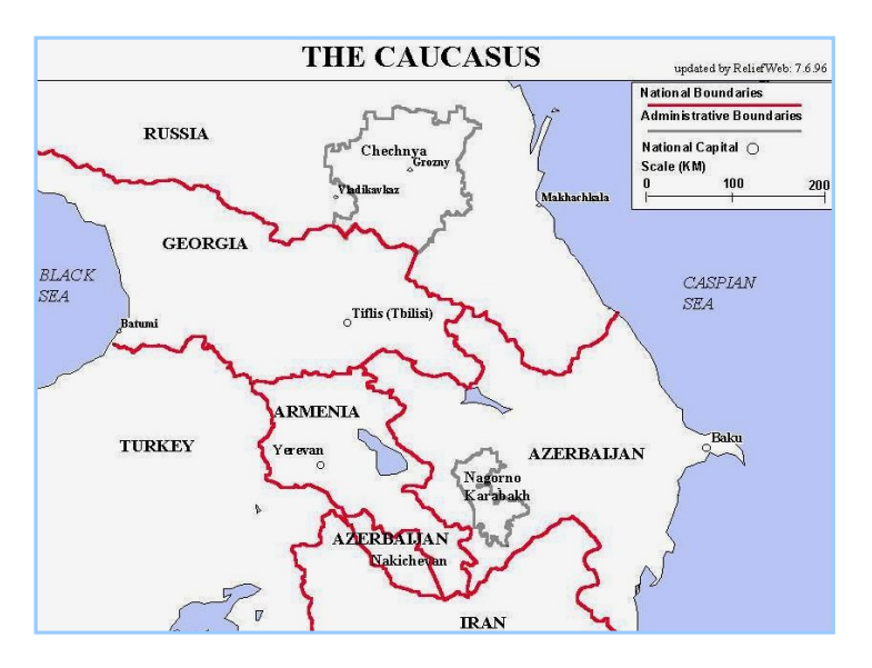
Figure 1. A Map of South Caucasus

One of the most arid zone of Armenia is the Ararat valley. The annual precipitation here is around 200-250 mm. Maximum precipitation is recorded in high mountainous areas at around 1000 mm per year. In Ararat valley, the average precipitation in summer months does not exceed 32-36 mm. The average annual wind velocity in Armenia is distributed unevenly in the range of 1.0-8.0 meters per second. In some regions, particularly in Ararat valley, mountain valley winds are quite common. In summer, their velocity reaches 20 m/s and over. The summer is temperate, at the end of July the temperature in Ararat valley varies between 24-26°C.