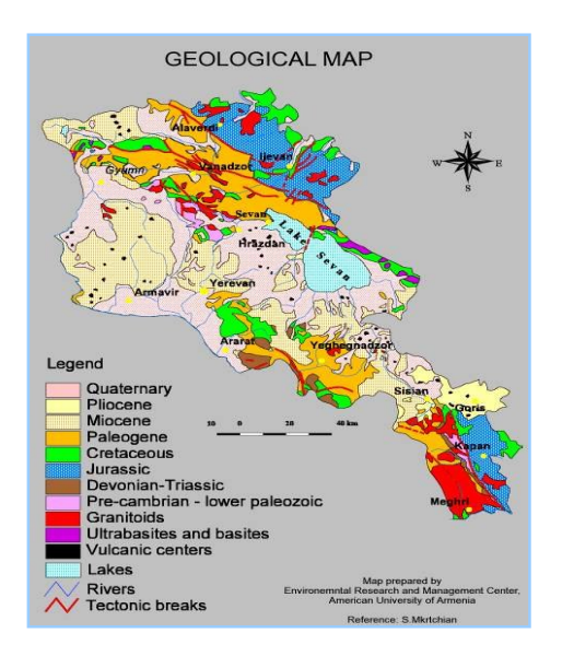
Figure 2. Geological Map of Armenia

The landscape of the flat portion of the Ararat Valley is desert-semi-desert, with typical grey-brownish soils (Fig.3). In some areas sandy hills, salt-marshes, saline soils as well as wetland coexist. A major part of the plain is cultivated and covered with crops - orchards and wine yards- and irrigation requiring soils. The uncultivated part of the territory is covered with xerophyte, halophyte and wormwood.