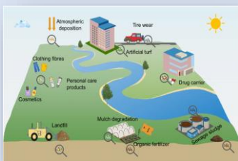
Figure 1. Urban sources of microplastics