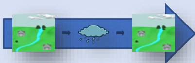
Figure 2. General overview of the sampling method