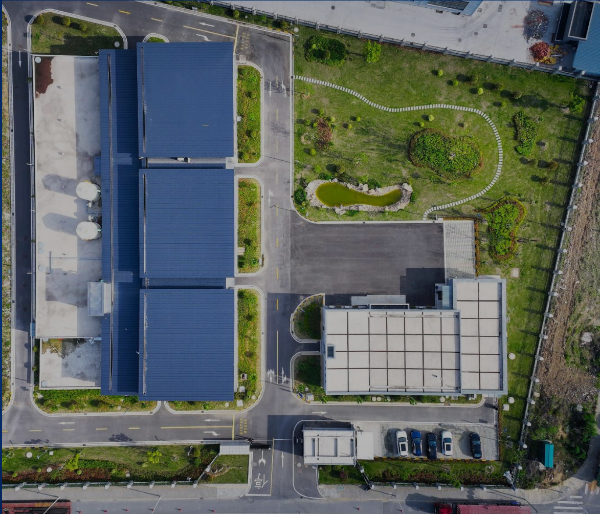
传统水处理工程 Traditional water treatment process