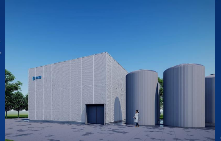
金科环境 新水岛 NEWATER ISLAND