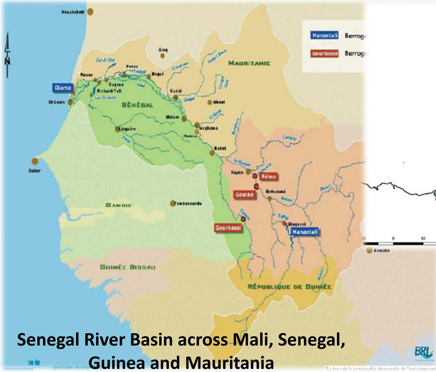
Senegal River Basin across Mali, Senegal, Guinea and Mauritania