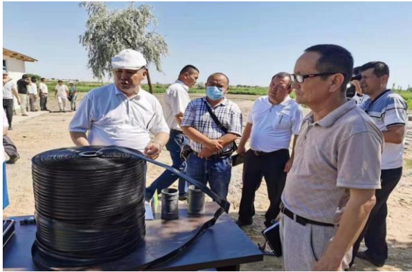
Project in Aral Sea Basin

6 times of trainings on water resources management and drinking water safety to Central Asia Countries.