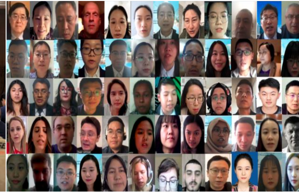
Environment Water and Energy (EWE) Conference

EWE conference held over 20 times online seminars on water resources management, climate change, disaster prevention, etc