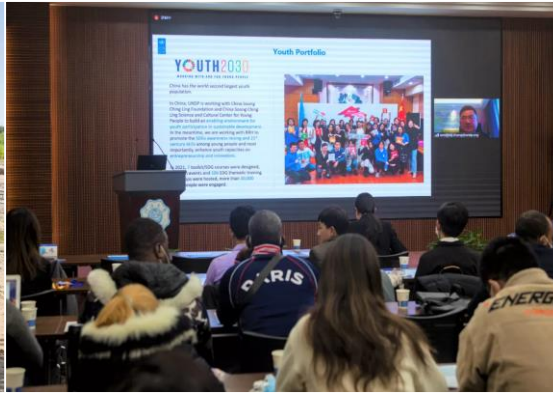
Capacity Building project in Lancang-mekong region

6 times of trainings on water resources management and drinking water safety to Central Asia Countries.