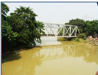
Fig. 2: 'Adi Ganga' – point of origin from Hughli River