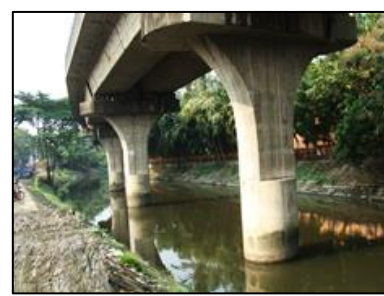
Fig. 4: Metro Railways pillars