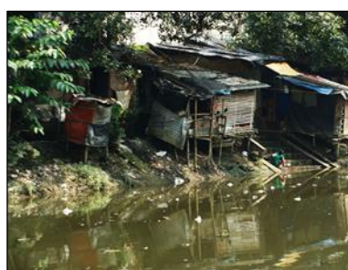
Fig.3: The shanties on the bank